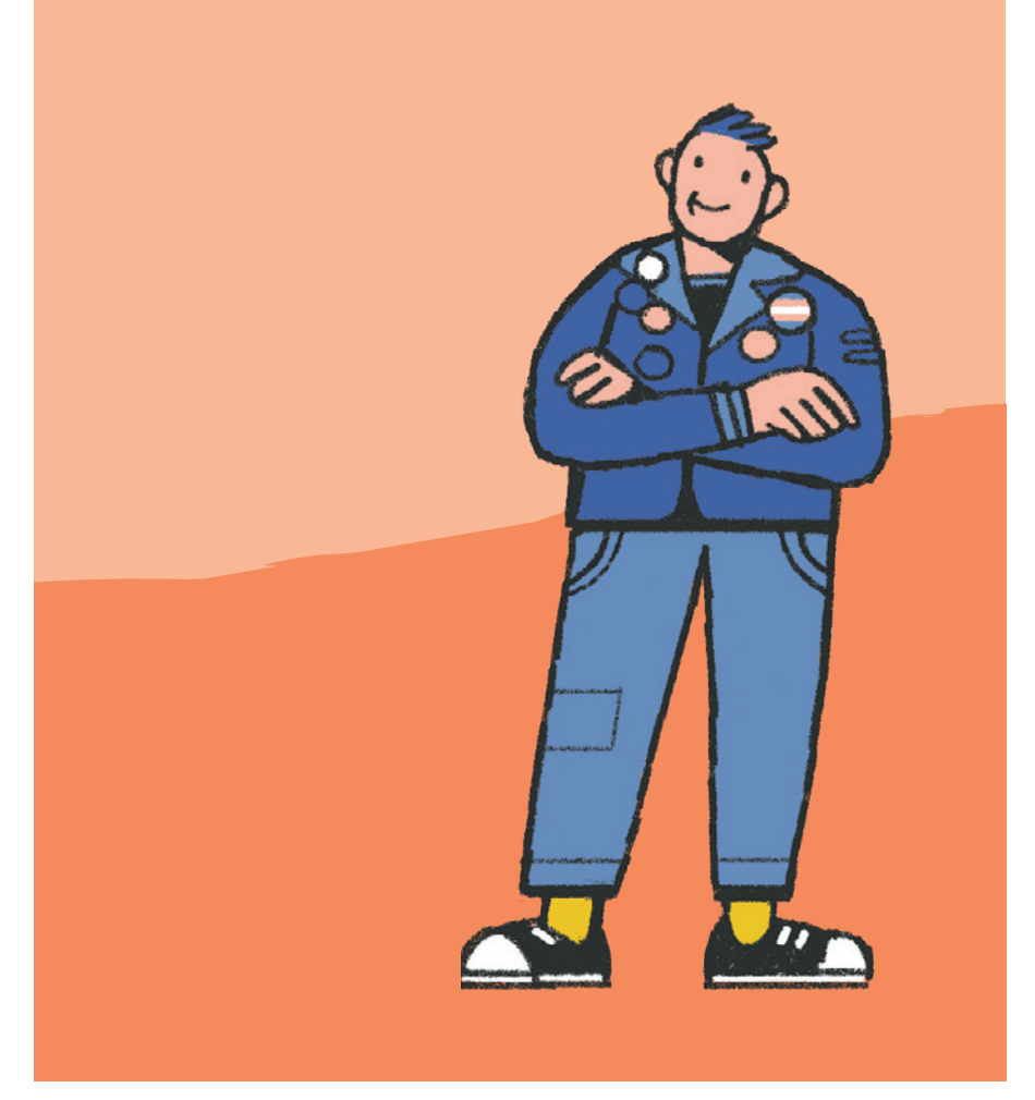
Metonym | noun | A word, name, or expression used as a substitute for something else with which it is closely associated.

"MOST PEOPLE IN MY SITUATION, THEY DON'T HAVE FAMILY TO TURN TO, THEY DON'T HAVE THE SUPPORT."