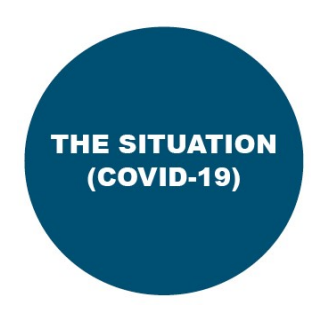
Instead of this anxious

Extra layers of anxiety get added to the onion when you are thinking and behaving in unhelpful ways. Lack of routine, isolation, checking behaviours, over-exposure to the media, and unhelpful worry or rumination add extra layers to your anxiety onion.